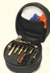
FG-645-9 9MM Pistol Cleaning System

For more information visit: www.otistec.com Or call: 1-800-OTISGUN Find us on Facebook, Twitter and YouTube