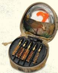
FG-750-RT Hardcore Hunter® Cleaning System

Products shown are only examples. Offer valid on any purchase made through otistec.com or 1-800-OTISGUN.