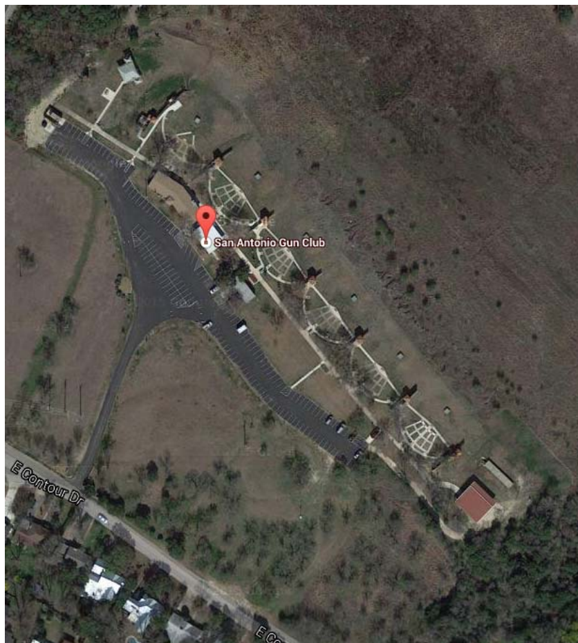
San Antonio Gun Club 928 E Contour Drive San Antonio, TX 78212-1762 (210) 828-9860 - www.sagunclub.com